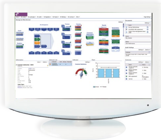
The Director reviewing a business process map