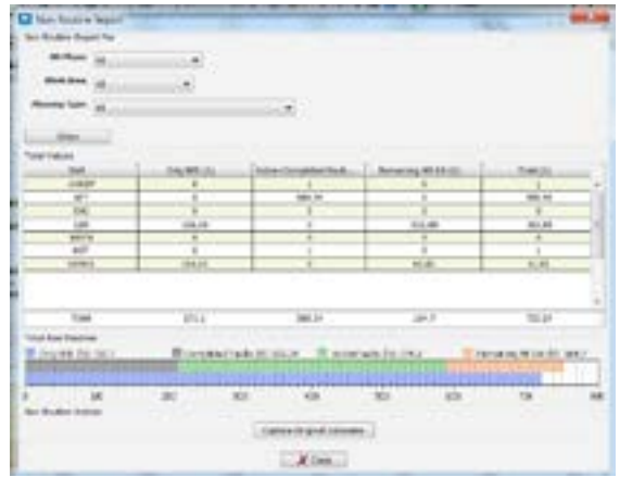
Resource utilization graphs to quickly spot potential bottlenecks